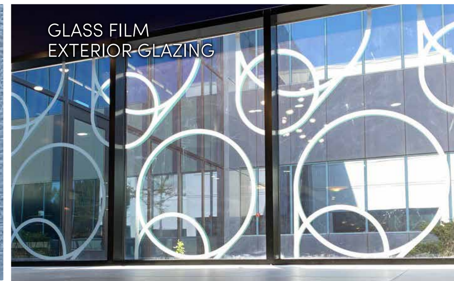
GLASS FILM EXTERIOR GLAZING