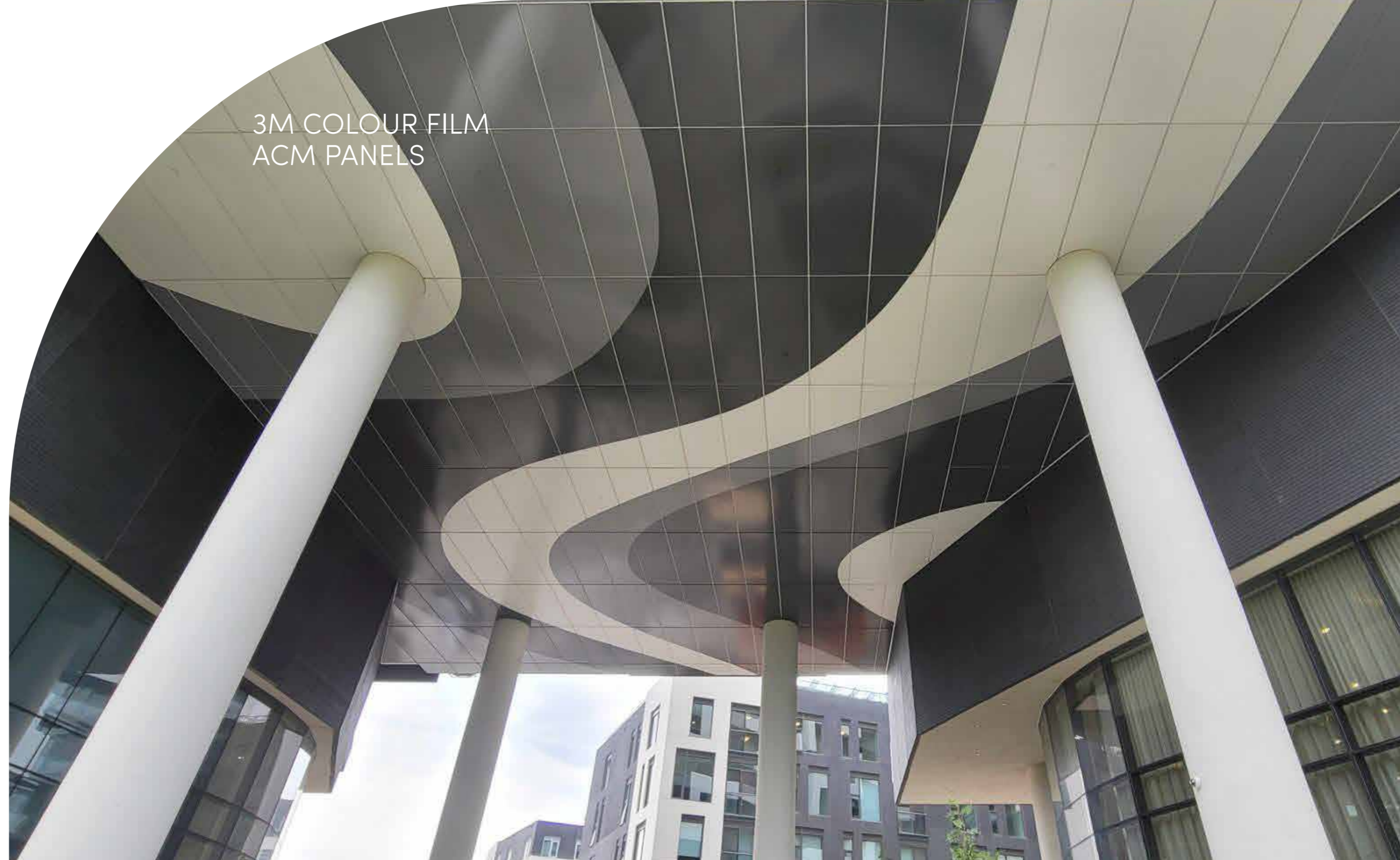
3M COLOUR FILM ACM PANELS