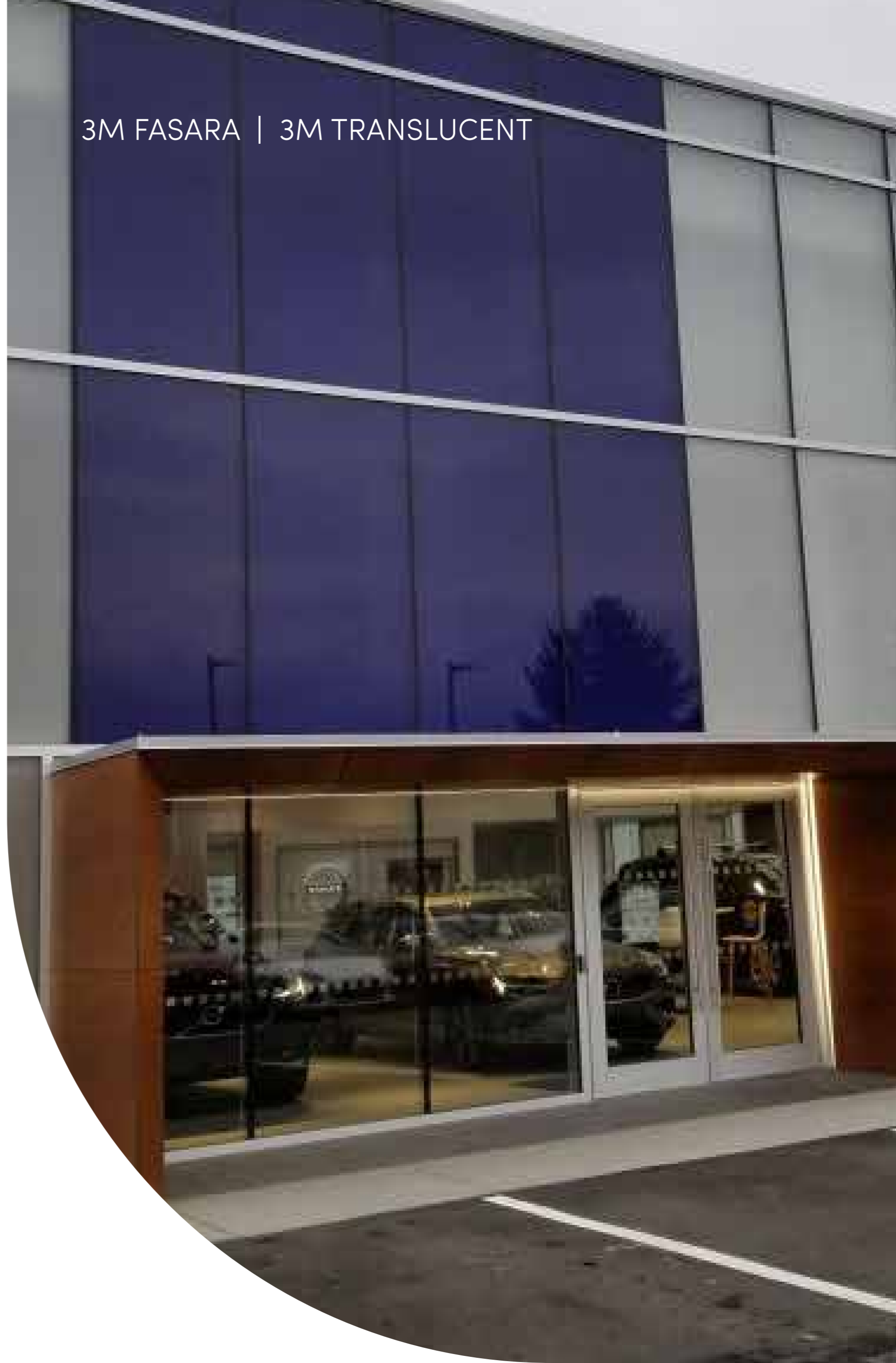
3M FASARA | 3M TRANSLUCENT