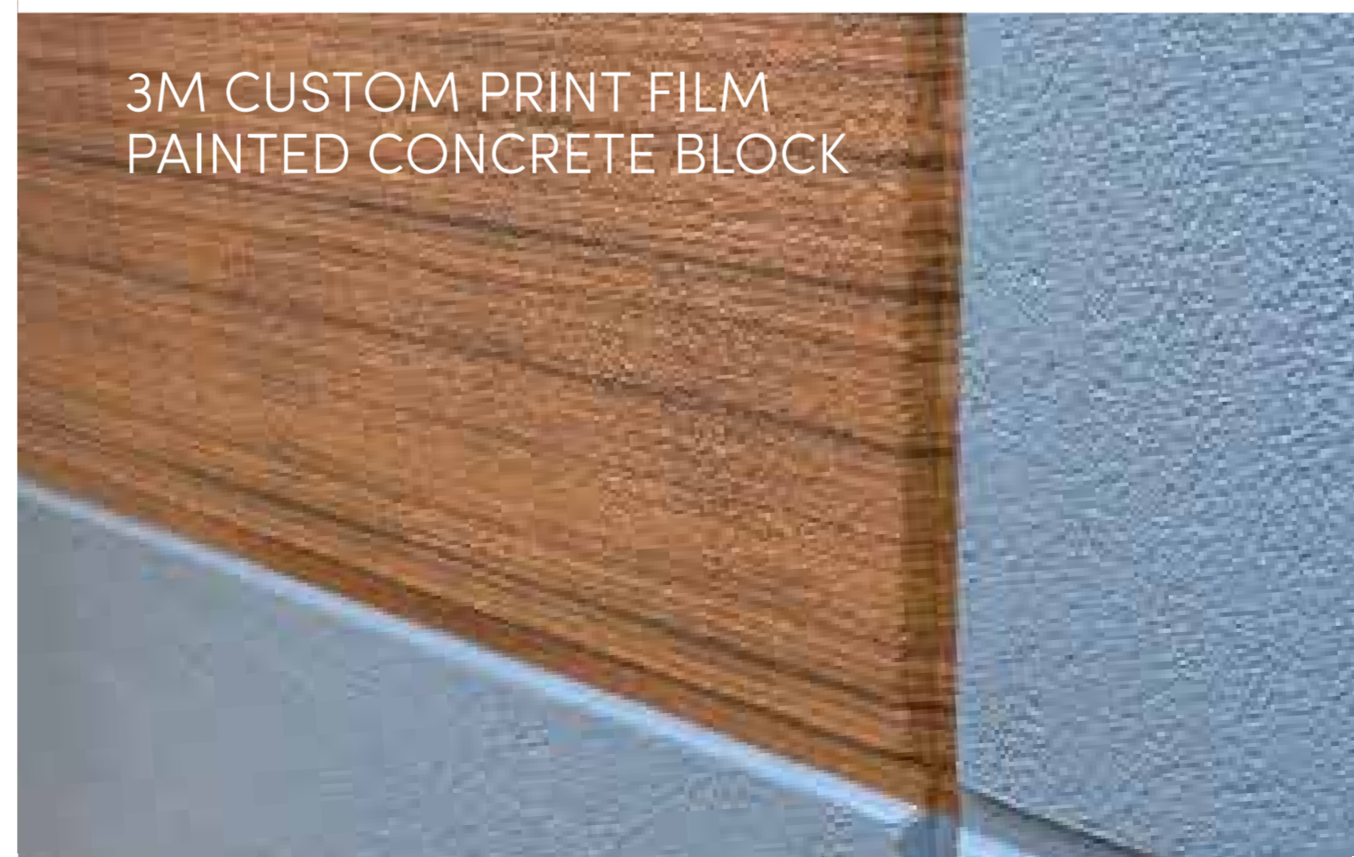
3M CUSTOM PRINT FILM PAINTED CONCRETE BLOCK